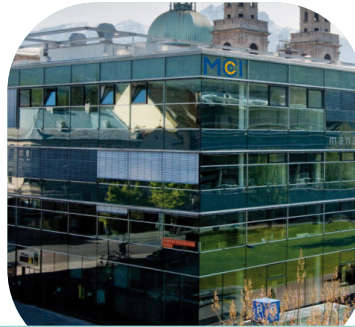
Management Center Innsbruck