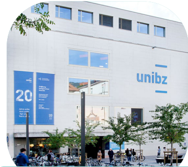
Libera Università di Bolzano