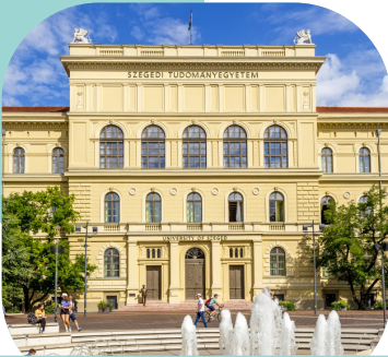
University of Szeged

in an international consortium of six partners: